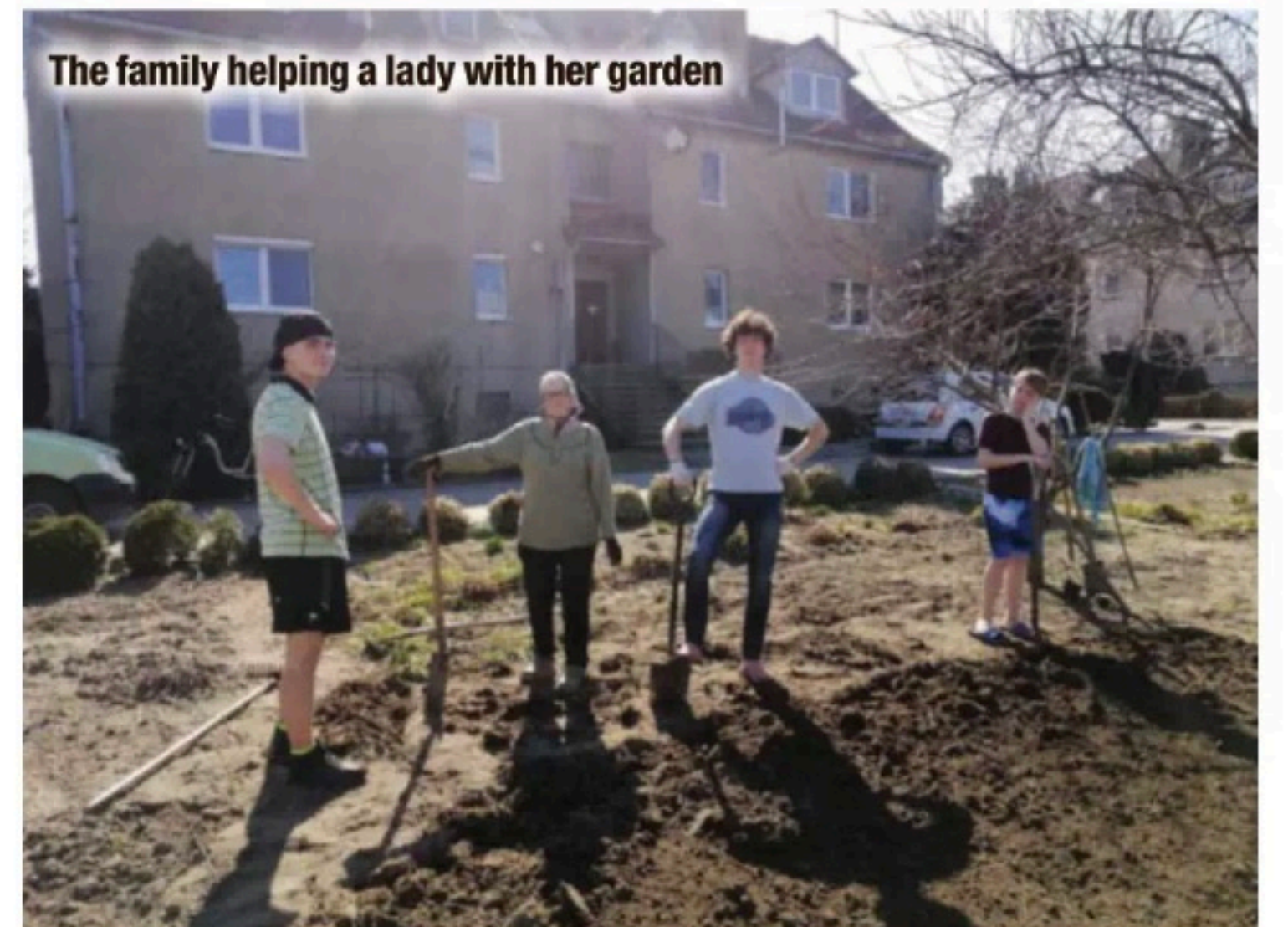
The family helping a lady with her garden