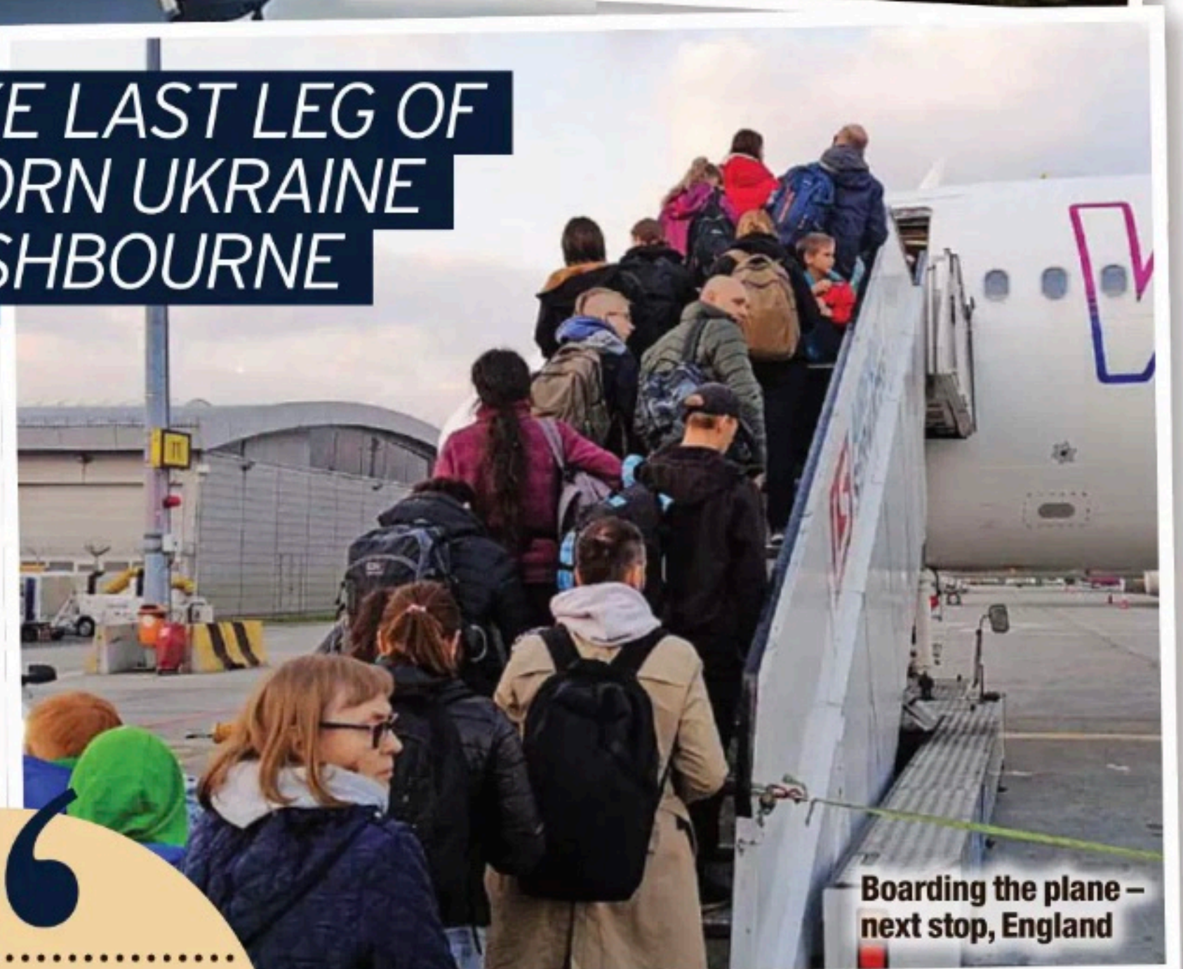
Boarding the plane - next stop, England