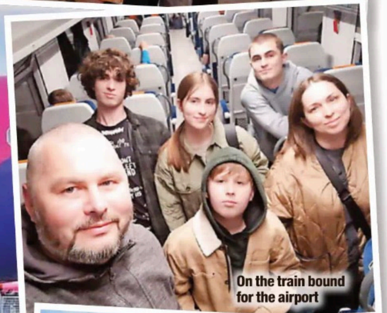
On the train bound for the airport