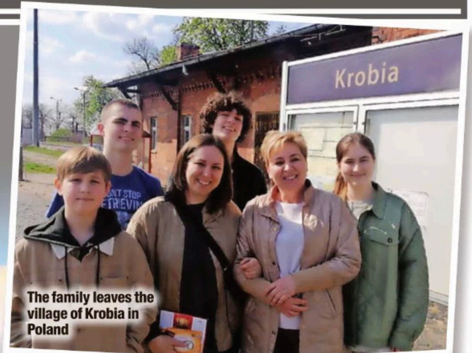
The family leaves the village of Krobia in Poland

Thank you for you support, please stand with us for Ukraine.